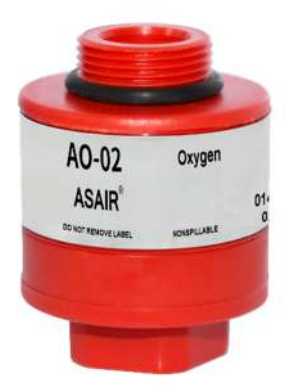
Figure 1. AO-02 Oxygen Sensor

The AO-02 oxygen sensor is designed to be for various instruments related to oxygen testing, such as motor vehicle exhaust gas detection equipment, exhaust gas environmental protection detection equipment and oxygen index testing equipment, etc. The use is limited to system monitoring. The data provided in this document are valid at 20°C, 50% RH and 1013 mBar for 3 months from the date of sensor manufacture. Please strictly follow the instructions for operating the oxygen analyzer and replacing the oxygen sensor.